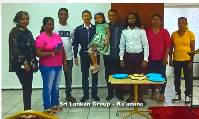
Sri Lankan Group - Ra'anana

Tel Aviv is a city on the coast of Israel by the Mediterranean Sea. It has lots of buildings from the 1930s with a style called Bauhaus, especially in an area called the White City. There are museums like Beit Hatfutsot, which shows the history of Jewish communities using pictures and videos. Another museum, the Eretz Israel Museum, talks about the country's archaeology, folklore, and crafts. It even has some old ruins from around 12th-century B.C. that they are digging up right there.