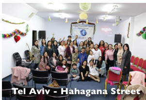
Tel Aviv - Hahagana Street