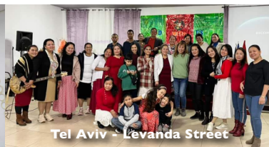
Tel Aviv - Levanda Street